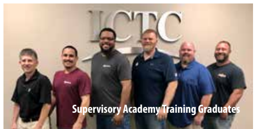
Supervisory Academy Training Graduates